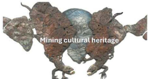
Mining cultural heritage