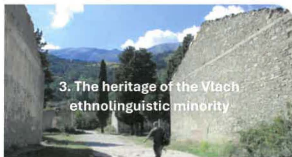
3. The heritage of the Vlach ethnolinguistic minority