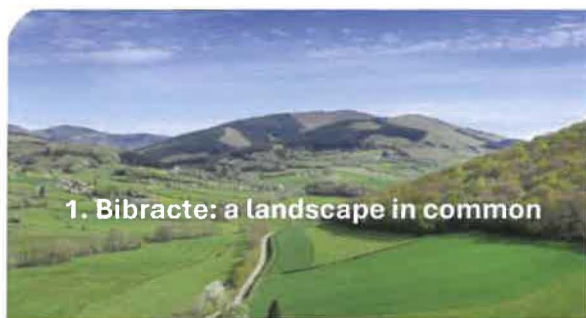
1. Bibacte: a landscape in common

Through a series of pilot cases , the project aims to demonstrate how cultural heritage can be used as a driver for sustainable and fair development. Pilots have been carefully chosen to represent a wide range of European territories, communities and heritage, including rural and agrarian landscapes, memory places of local identities, minorities, and conflictive dark heritage. They represent the focus for every part of the research enabling the testing of ideas in local contexts, facilitating effective communication and cooperation, and activating co-creative problem-solving through interdisciplinary and trans-sectoral approaches.