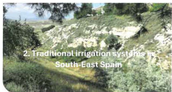
2. Traditional irrigation systems in South-East Spain