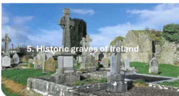
5. Historic graves of Ireland