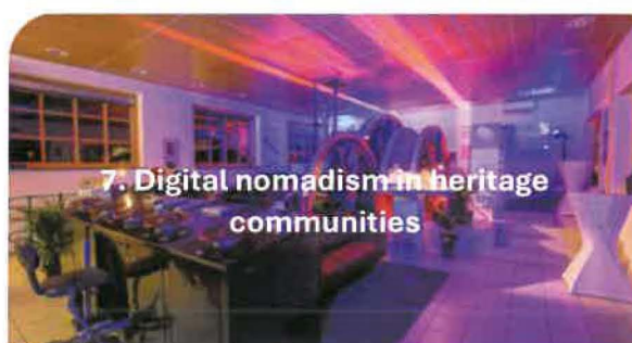
7. Digital nomadism in heritage communities